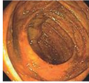
Poor Bowel Preparation